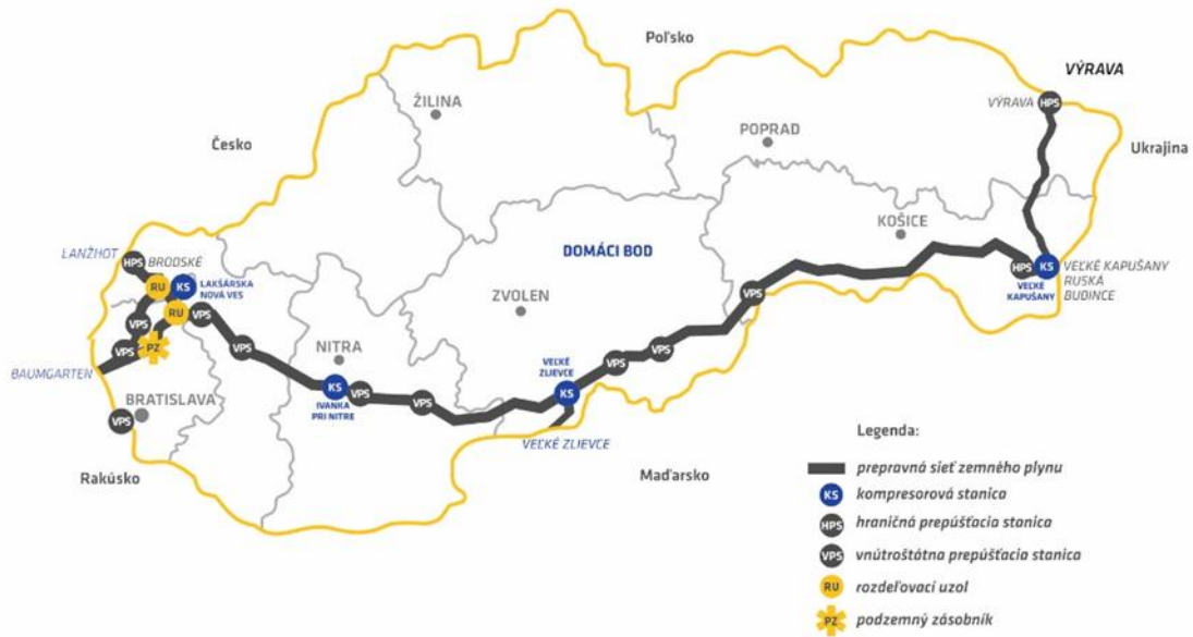
Figure 1: Transmission system of Eustream

Reference prices, calculated on the basis of this Methodology, are determined for the tariff period from 1 January 2027 till 31 December 2027, which is equal with the length of rest of the regulatory period ( note: the terms “regulatory period” and “tariff period” are equivalent in this Methodology due to this reason ) approved by the Regulatory Policy published by ÚRSO.